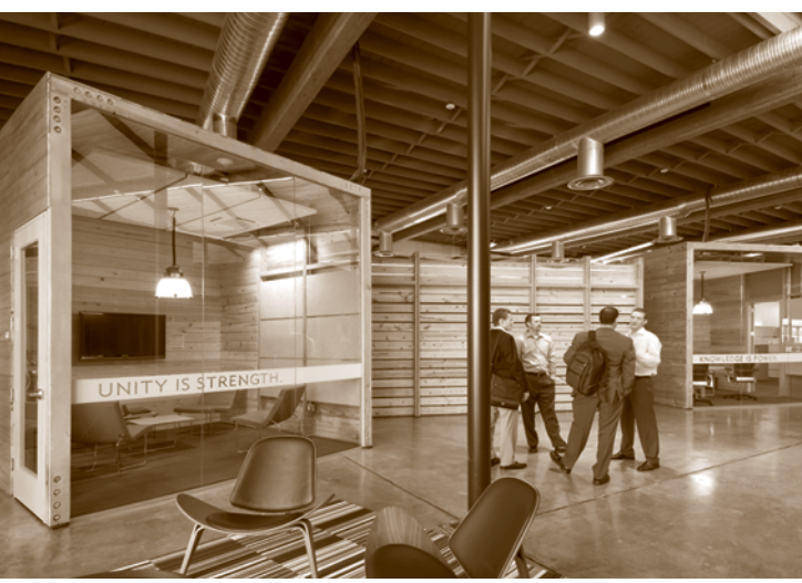
The Livestrong Foundation utilized 88% of recycled/reused materials, remilled salvaged roof decking, and repurposed concrete. It features an opened façade and roof with clerestories, an ultra-high-efficiency variable-volumerefrigerant mini-split system, and lighting controls.

However, one of the exterior freestanding sandstone