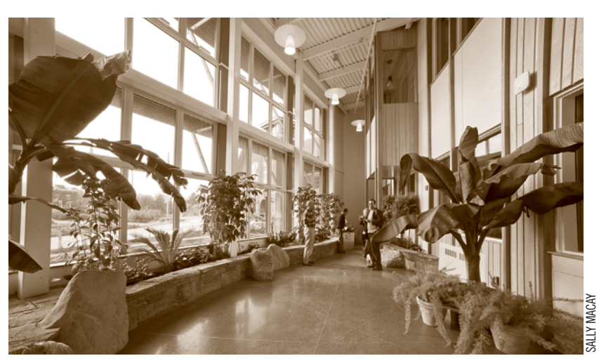
Triple-pane windows provide natural light to significantly reduce electricity use at the renovated George D. Aiken Center at the University of Vermont, now home to UVM's Rubenstein School of Environment and Natural Resources.

"We created a vault outside the building to manage the large number of pipes drilled through an existing foundation wall. Whereas newer buildings are able to adjust the building shell in small degrees to work with such systems, older buildings, built before the systems were invented, require such creative measures to integrate new systems," notes Allen.