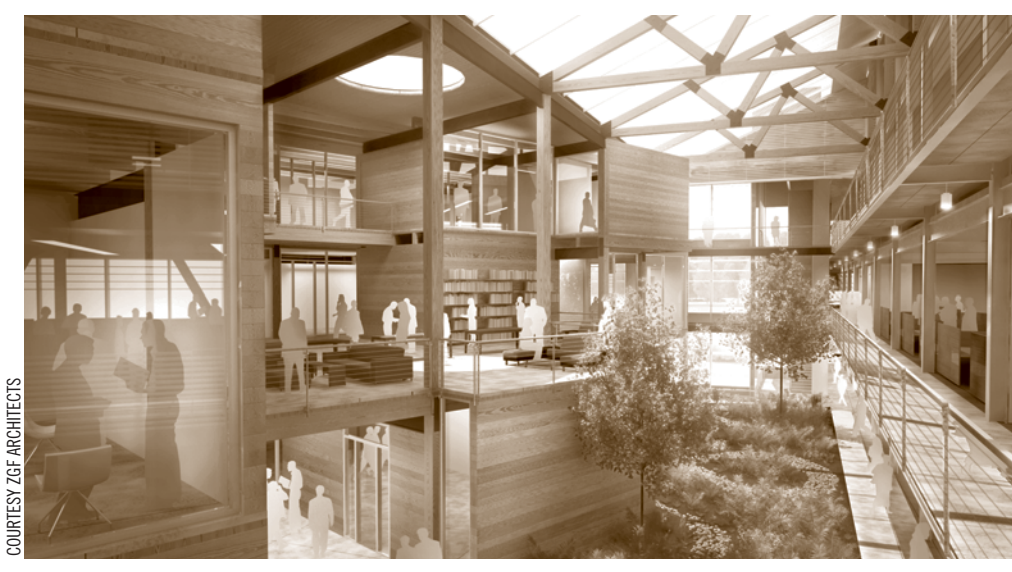
A 1940s warehouse building, originally constructed by the U.S. Army and subsequently owned by Boeing and the GSA, will soon become a high-performance office building for the U.S. Army Corps of Engineers in Seattle. It will be the first building in the Northwest region to combine geothermal with structural piles.