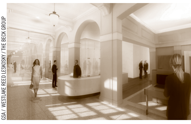
Just beginning reconstruction, this 1918 government building (top) will be converted into the new Wayne N. Aspinall Federal Building and U.S. Courthouse in Grand Junction, Colo. The reconstructed 41,562-sf courthouse will feature a 115 kW roof and canopy-mounted PV array and a geo-exchange system. The Building Team is headed by architecture firm Westlake Reed Leskosky and design-build firm The Beck Group.

design featuring a geo-exchange system tied to a variable refrigerant flow mechanical system, enhanced insulation, an advanced metering and monitoring system, a 115-kW roof and canopy-mounted PV array, and high-performance lighting systems.