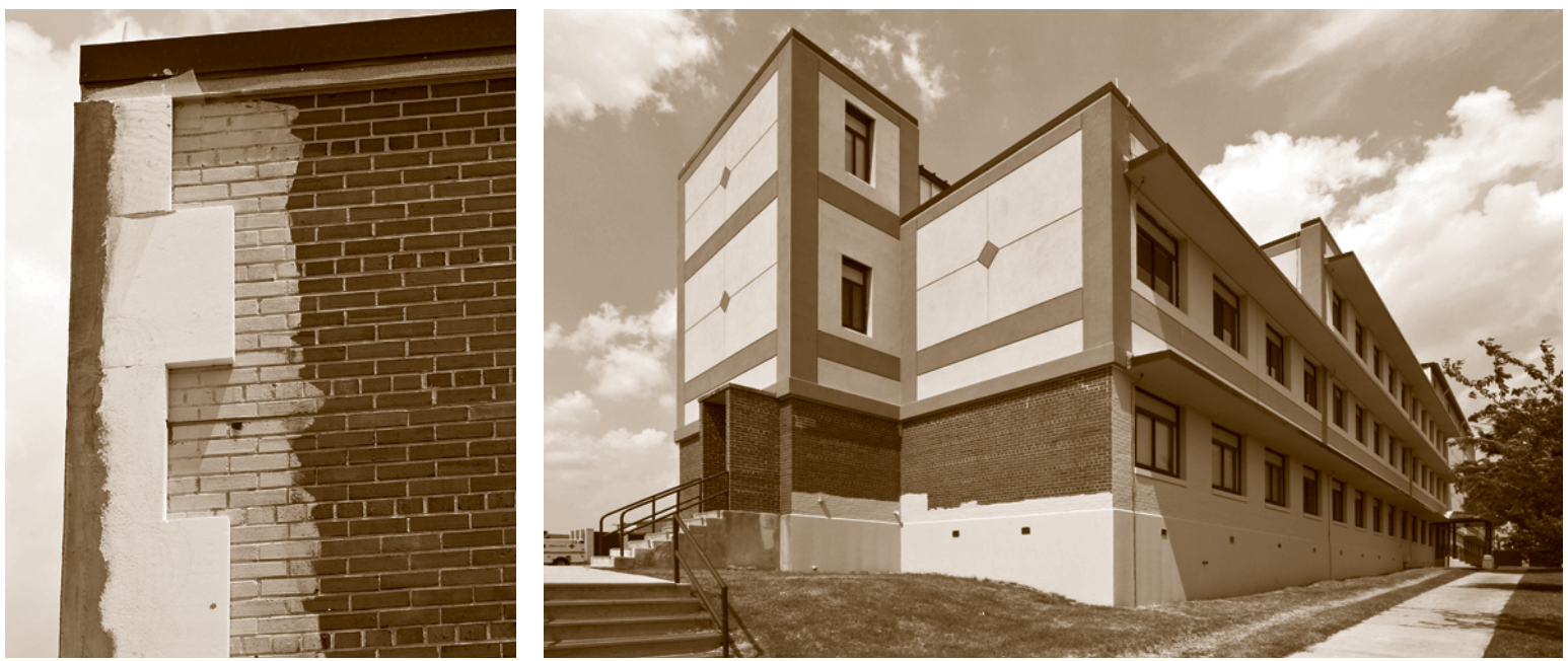
Overcladding in an existing building (left) using an exterior insulation and finish system (EIFS), with the finished work (right). EIFS can be used as overcladding on a masonry wall as long as the masonry is sound, to stop water penetration and improve the insulation R-value of the wall. Insulated metal panels are another increasingly popular overcladding material.

The use of vegetated roofing and roofing-integrated photovoltaic systems is also on the rise. In North America, green roofs were at least 25% more likely for a reconstruction project, according to a 2011 survey by Green Roofs for Healthy Cities. Use of rooftop PV is also expanding, often in concert with planted surfaces where the weight of the PV array minimizes uplift and vegetation damage while the planted surfaces cool the PV modules, improving their efficiency.