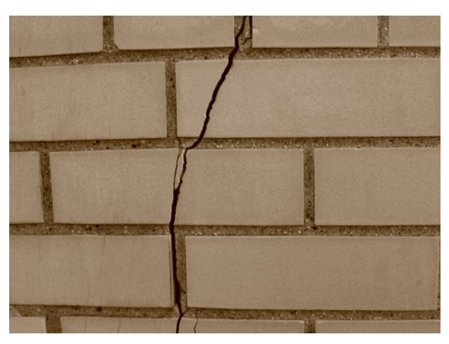
Vertical crack in a glazed brick façade. A major characteristic of Modern buildings was the shift from façades with thick, massive walls and proportionally few windows to slimmer wall construction and more widespread use of glass.

Redundancy in construction, such as multi-wythe bearing walls and massive pillars and columns, affords older buildings greater resiliency than their Modern counterparts. As developments in material technology and construction methods permitted ever shorter construction schedules, the ability of the final product to withstand decades of exposure to the elements was often compromised in service to expediency.