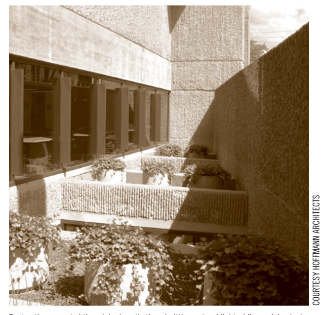
Restoration recreated the original aesthetic, admitting natural light while resolving leaks and improving thermal performance. Appropriate guidelines are needed to synthesize accepted preservation practices with long-term restoration options that maintain the values of the Modern movement.

www.BDCuniversity.com BUILDING DESIGN+CONSTRUCTION MAY 2012 WP43