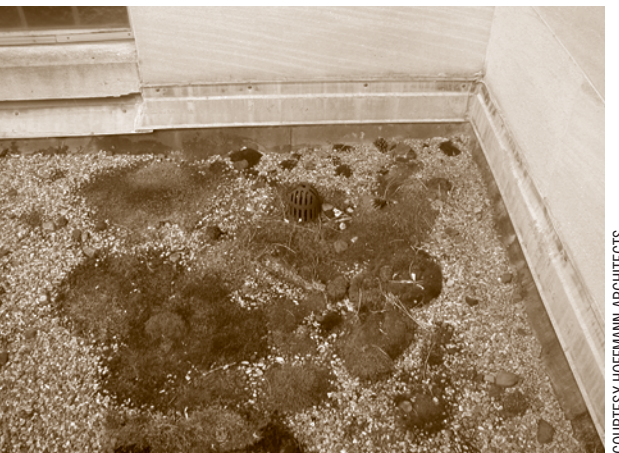
Organic growth and debris on the built-up roof of a Modernist structure. The materials and techniques of Modern architecture allowed for rapid and prolific construction, which resulted in a historically unprecedented volume of new structures during this period.

Changes in program. Modern architecture tended to envision the building as a machine or tool, drawing inspiration from the forms of grain elevators, steamships, and automobiles. Yet just as it is difficult to imagine using