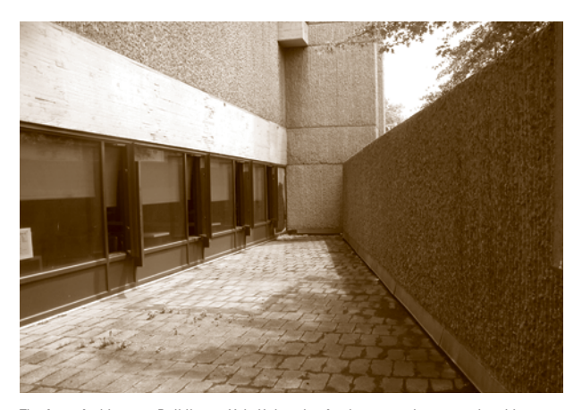
The Art + Architecture Building at Yale University. A prior renovation covered architect Paul Rudolph's light wells with a single flat roof. Such misguided "improvements" can destroy both the functionality and aesthetics of Modern-era buildings, many of which are beginning to cross the half-century mark.

Replacement can address many of these concerns,