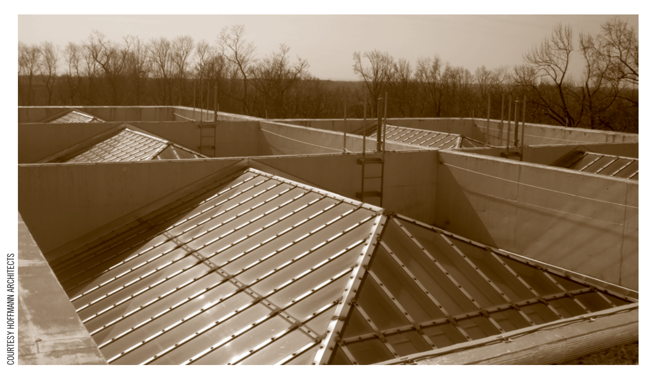
An integral part of the balance of light and mass in many Modernist buildings, skylights are also notorious for leaks, condensation, and poor energy performance. Modernist buildings face a unique threat in that Modernism's break with the artistic styles that preceded it have called into question current perceptions of the historical value of these structures. "The perceptions of one time period with respect to the previous one are often reactionary and, to some extent, negative," according to Bradley T. Carmichael, PE.

improving a building's energy profile can be difficult to reconcile with historic accuracy in preservation.