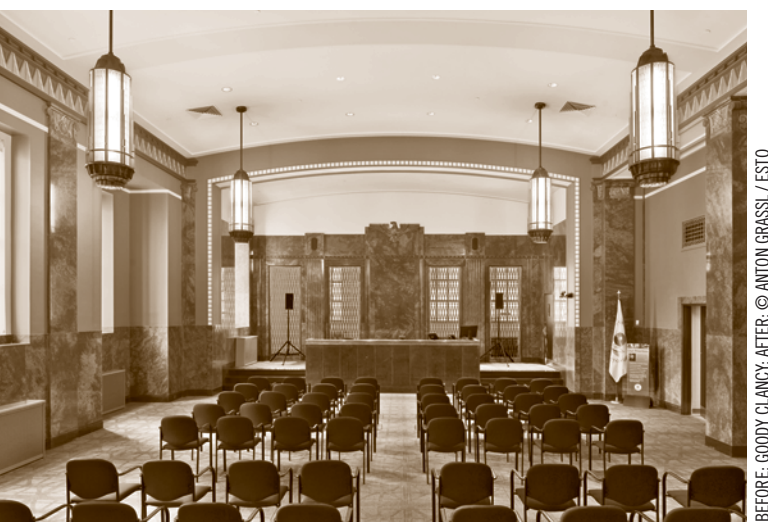
A courtroom in the original John W. McCormack building (top) and the reconstruction (above). The 1933 Art Deco federal building, designed by Cram & Ferguson, was the site of many historic judicial decisions on New Deal legislation. In 1972 it was renamed for the former Speaker of the House from Boston. The project won Silver honors In Building Design+Construction's 2011 Reconstruction Awards.

10 "LEED Certification: Where Energy Efficiency Collides with Human Health," Environment and Human Health, Inc., p. 8, at: http://www.ehhi.org/leed/.