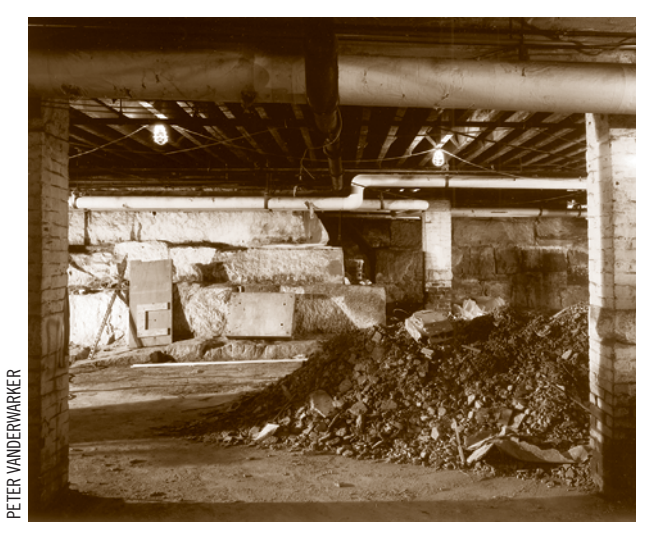
Before/after photos of the undercroft space at Trinity Church, Boston, a National Historic Landmark designed by H. H. Richardson. The renovation created program space in the underutilized basement, increasing functionality without having to build a new addition.

9 "The Greenest Building: Quantifying the Environmental Value of Building Reuse," Preservation Green Lab, National Trust for Historic Preservation, 2011, p. vi, at: http://www.preservationnation.org/information-center/sustainable-communities/sustainability/green-lab/valuing-building-reuse.html.