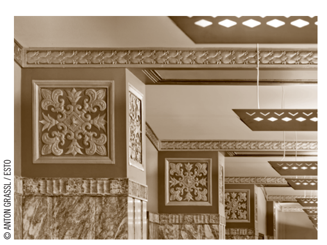
Detail of the intricate restoration work at the John W. McCormack Post Office and Courthouse, in Boston, a 702,000-gsf project completed at a construction cost of $160 million.

known to include many well-recognized toxic substances .... The final building structure comprises thousands of these chemicals."10