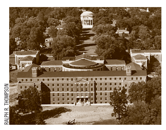
The University of Virginia chose to renovate rather than replace New Cabell Hall in part due to the significant environmental impact of new construction. PVs were ruled out as not being cost-effective.

New Cabell Hall aerial view, n.d.